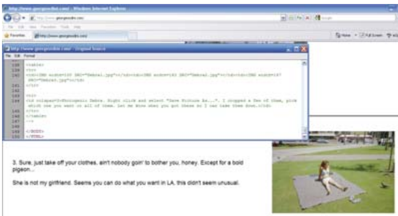
Image 3 – Sodini’s Web page with comment about the woman in the picture.

What is significant is that while “investigating,” I discovered that the killer had put hidden content on his Web page that he was most likely simply keeping in draft form, to be edited and posted at a later time.